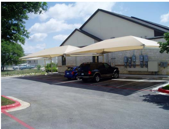
Reserved Covered Parking