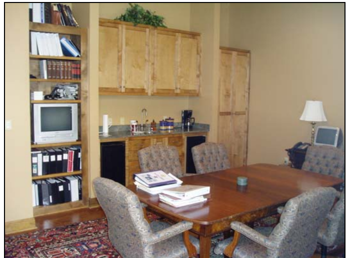
Conference Room with Coffee Bar